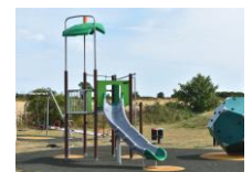
Francis Road Play Area