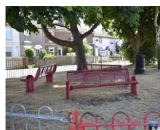
Church Road Seating area