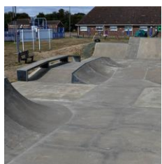
Kessingland Skate Park