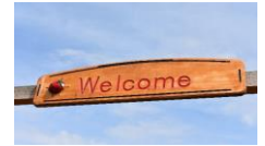
Kessingland Community Kitchen & Wildlife Garden