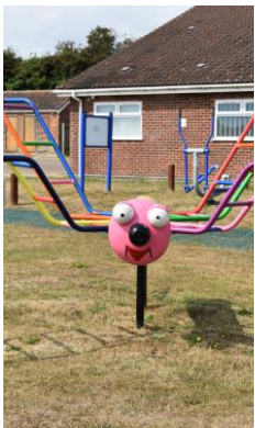
Refurbished Spider, Francis Road